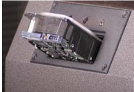
Large Hard Drives