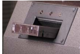
Tape Cartridges DLT, LTO, 8mm